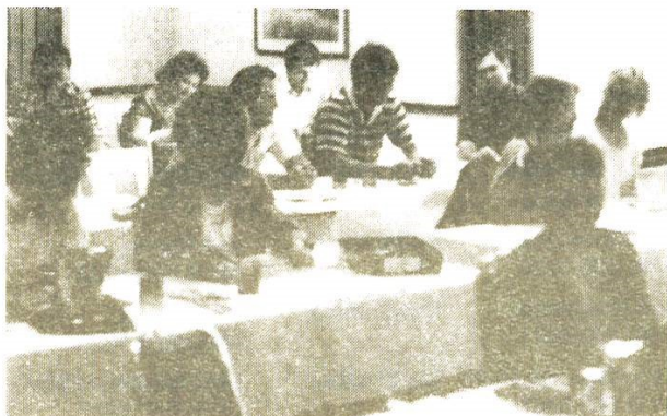
Mappers compiling information at workshop in Columbia

Future workshops are in the developmental stage. Topics being considered are Flight Planning for New Aerial Photography, Trouble-Shooting-Problems and Solutions and additional workshops on inking. If you have any suggestions or preferences, let us know.