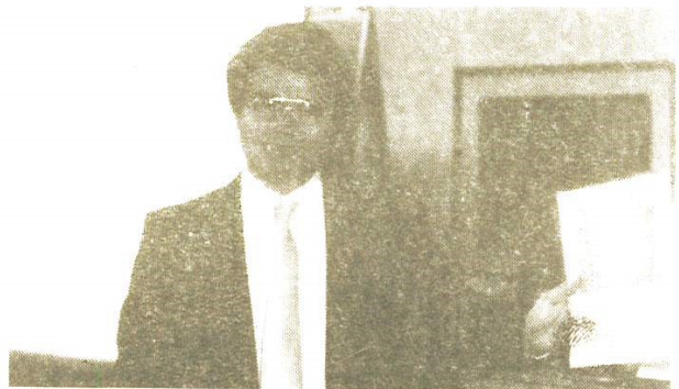
"Wyandotte County, Kansas Land Records System" by Ed Crane, Wyandotte County Surveyors Office.