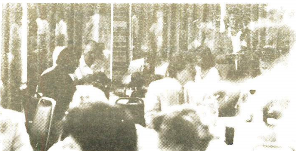
Members enjoying Deli Luncheon sandwich bar.