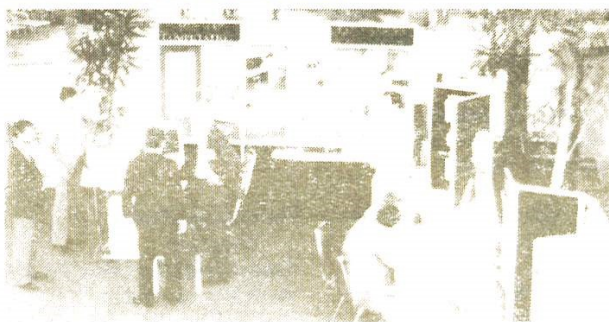
Interesting exhibits were provided by 12 different companies.