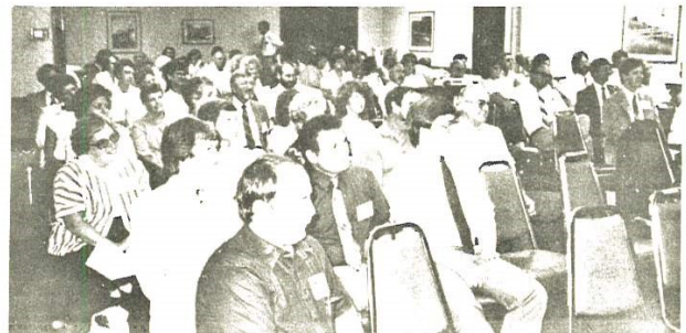
Members enjoying the program at the convention.