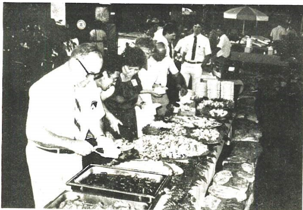
The food was good too. The Program Convention committee did a great job.