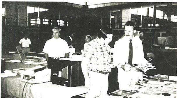
Interesting exhibits were provided by 14 different companies.