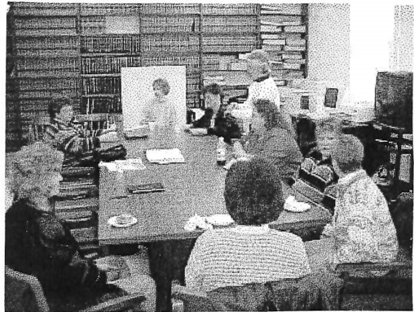
West Central MMA Meeting 2/27/02